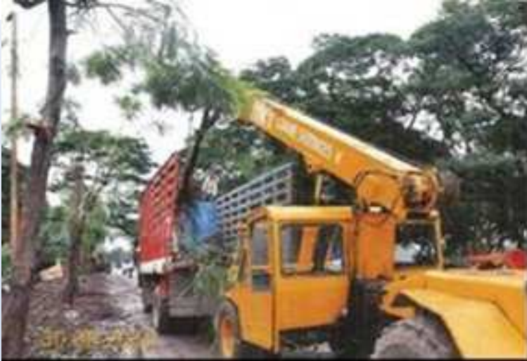
Transportation of Trees