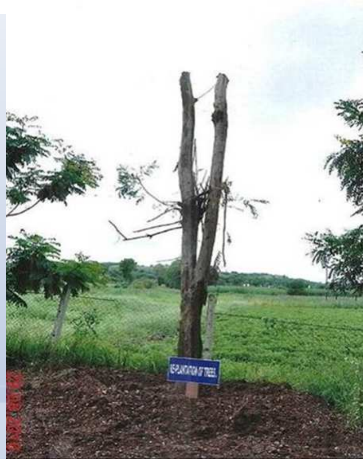
Tree species: Cassia Transplanted Near Jijamata School