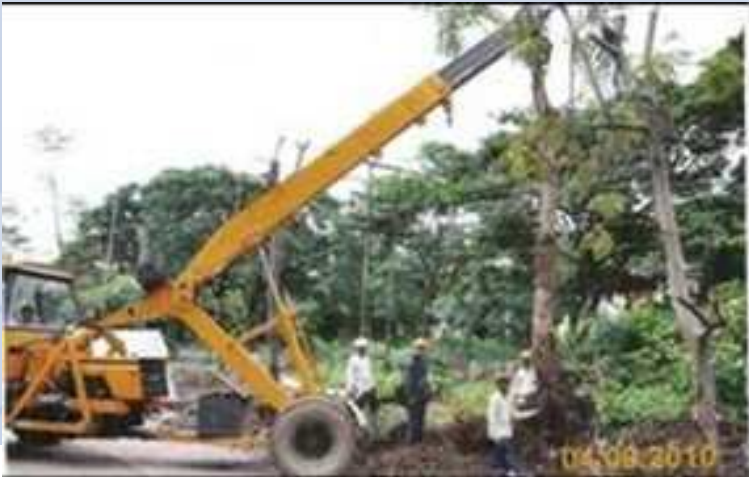
Placing of Uprooted Trees