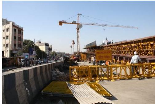
Nashik Phata, photo taken in Feb 2011