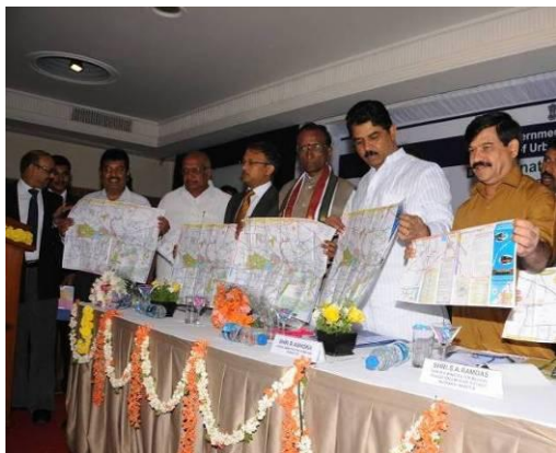
Mysore city route map being released

also convinced that KSRTC will effectively implement ITS programme and the city will benefit by way of a more punctual and efficient public bus service.