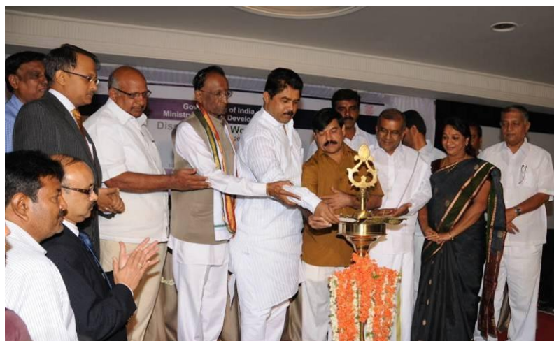
Lighting of lamp by dignitaries

The participants comprised citizens of Mysore City, NGOs & Associations, Media, Students, Public Representatives (Ministers, MLAs, Corporators etc.), Representatives of Mysore City Administration, KSRTC project stakeholders (Management, Drivers, Controllers, Conductors, Mechanics etc.), Representatives of Project Management Unit, Govt. of India, Govt. of Karnataka Representatives (KUIDFC, Dept. of Urban Development), Project Consultants, Project Implementation Agency etc.. The stakeholders were explained how they would benefit from the implementation of this project. The presentations were well received and highly applauded.